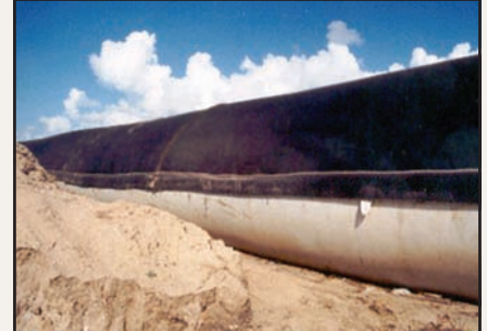
Protective cover shields Geotube® containers from sun's damaging UV rays.

Better yet, birds and other wildlife find the exposed Geotube® units ideal places to rest, sun, and fish.