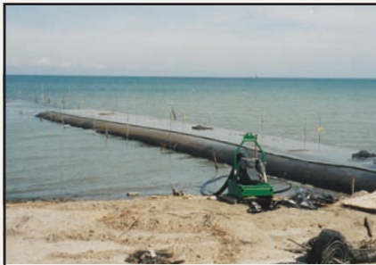
Geotube® containers being positioned to create groyne for shrimp farm inlet.

Because Geotube® units can be custom sized, groyne applications can be designed for optimum performance. Geotube® units can be filled with sand from the area when allowed, simplifying the construction process. If regulations require fill material to come from another location, the units can still be filled less expensively than other construction methods.