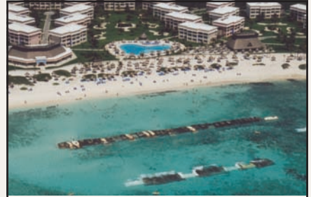
Geotube® unit placed offshore for use as a breakwater.

By using Geotube® technology to change wave patterns, millions of dollars have been saved in reduced property damage or expense for renourishing beaches.