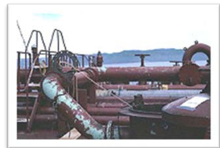
Blanking or blinding example

Blanking or Blinding: The absolute closure of a pipe, line or duct by the fastening of a solid plate that completely covers the bore and is capable of withstanding the maximum pressure of the pipe, line or duct with no leakage beyond the plate.