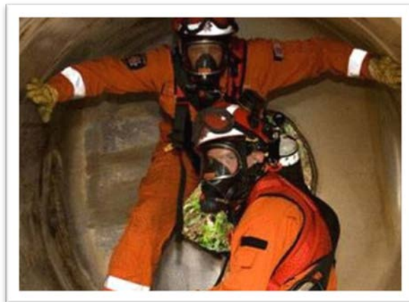
Figure 1: Air-supplying respirators

Figure 1 shows a rescue team wearing air-supplying respirators inside a confined space, in this case a tank.