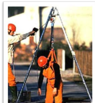
Full body harnesses and retrieval lines are necessary rescue equipment.

Only devices designed by the manufacturer and approved for moving humans should be used. The equipment must enable a rescuer to remove the injured employee from the space quickly without injuring the rescuer or further harming the victim.